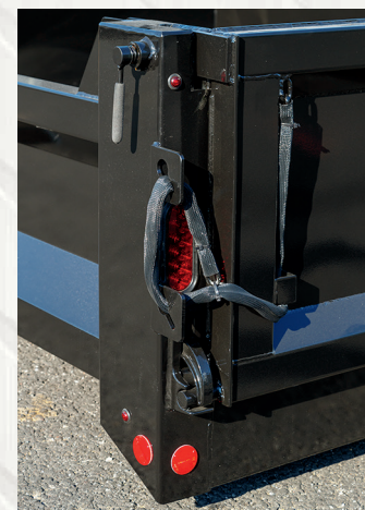
Screw Pin Top Release