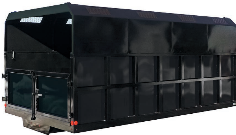
Shown on LB3000 body with 30" rear doors