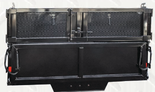
Optional dump tailgate and optional mesh on top doors