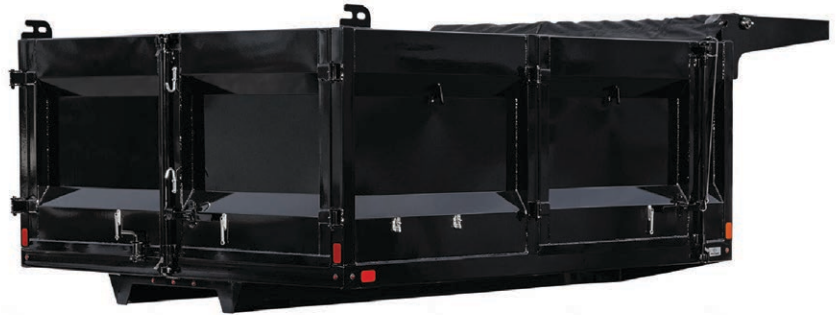
Shown with optional cab shield