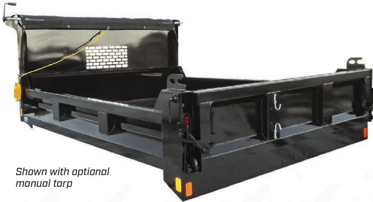
Shown with optional manual tarp