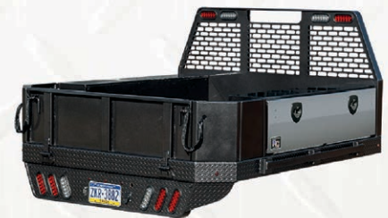
Shown with optional stainless steel toolbox lids