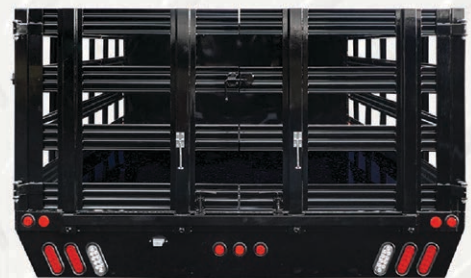
Shown with optional rear swing racks and full 10" light apron