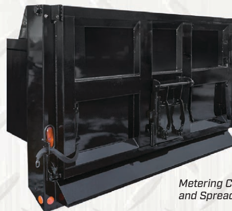
Metering Chute and Spreader Apron